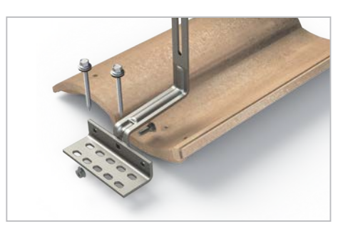
SIMPLE AND VERSATILE Multiple hole patterns and slotted connections provide adjustability. Stainless steel lag bolts bring long term peace of mind.